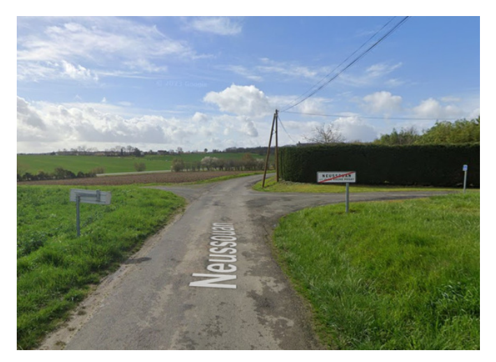
Step 8: At the exit of the village of Neussouan, turn left onto the pedestrian path.