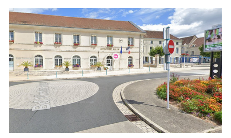
Step 1: Turn right onto Rue Pierre-Denis Rousseau