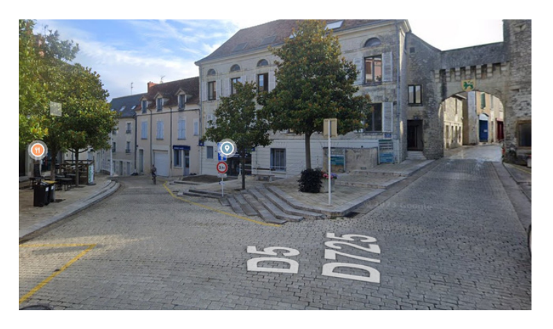
Step 3: Turn left at the intersection towards Rue de Falck.