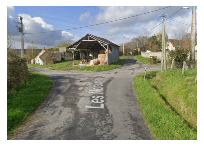
Step 7: Turn left following the "Les Moraux" road to the village of Neussouan.