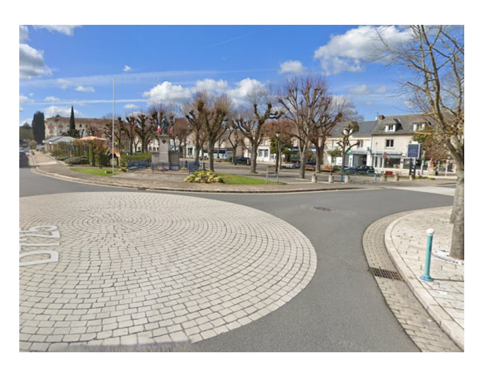
Step 11: Turn slightly to the right into Cour Pasteur.

Step 12: Turn right onto Rue Pierre-Denis Rousseau, then left onto Boulevard Victor Hugo to find the Tourist Office.