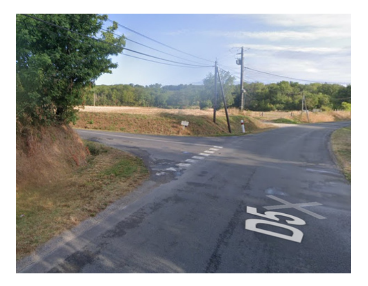
Step 6: Turn left onto "Les Moraux".

Step 5: Cross the D725B carefully, then continue straight on for around 700 m.