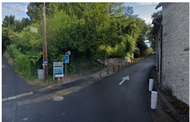
Step 4: Turn right towards Lésigny on Rue de Lésigny.