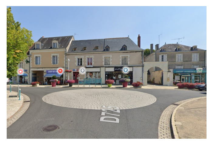
Step 2: Turn left onto Cour Pasteur