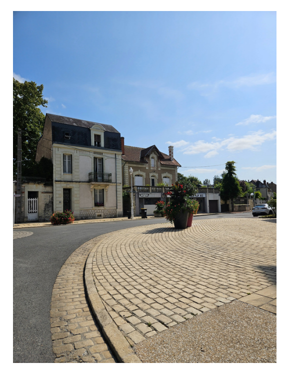
Step 1: Take a right onto Cour Pasteur.