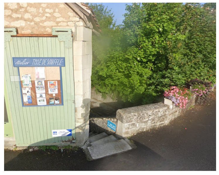
Step 9: Turn left before the bridge and take the stairs that go down to the entrance of the Parc des Confluences. Continue until you reach the park exit.