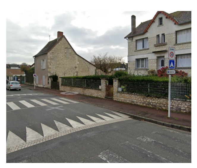
Step 10: At the exit of the Park, turn left onto Rue Pierre-Denis Rousseau.