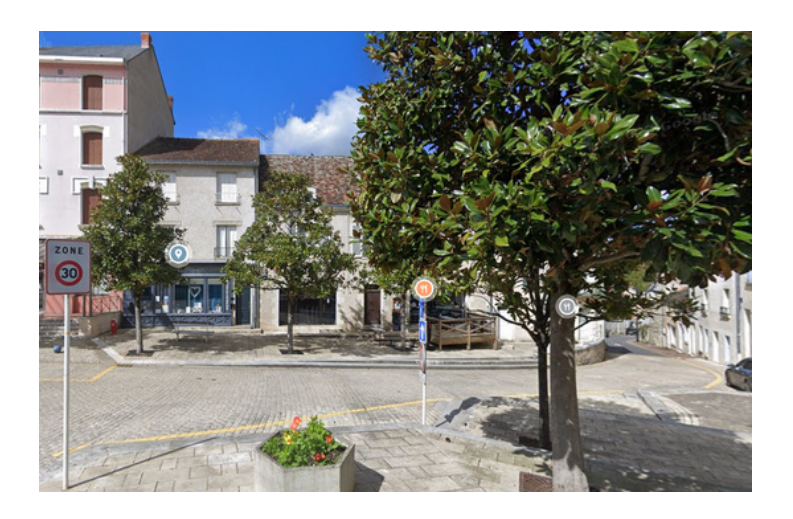
Step 8: Turn immediately right after the city gate onto Rue de Falck.